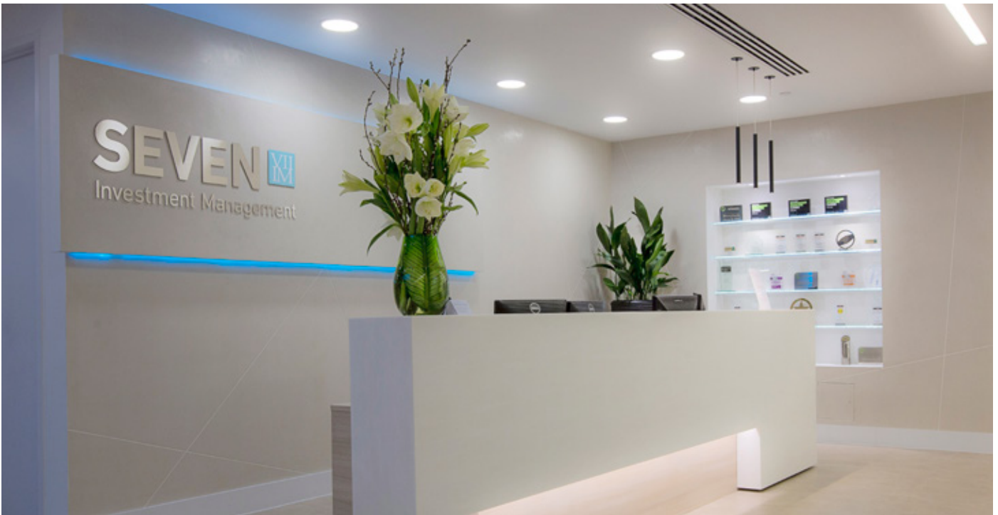
This innovative solution gives 7IM a flexible system that it can standardise on, across its infrastructure