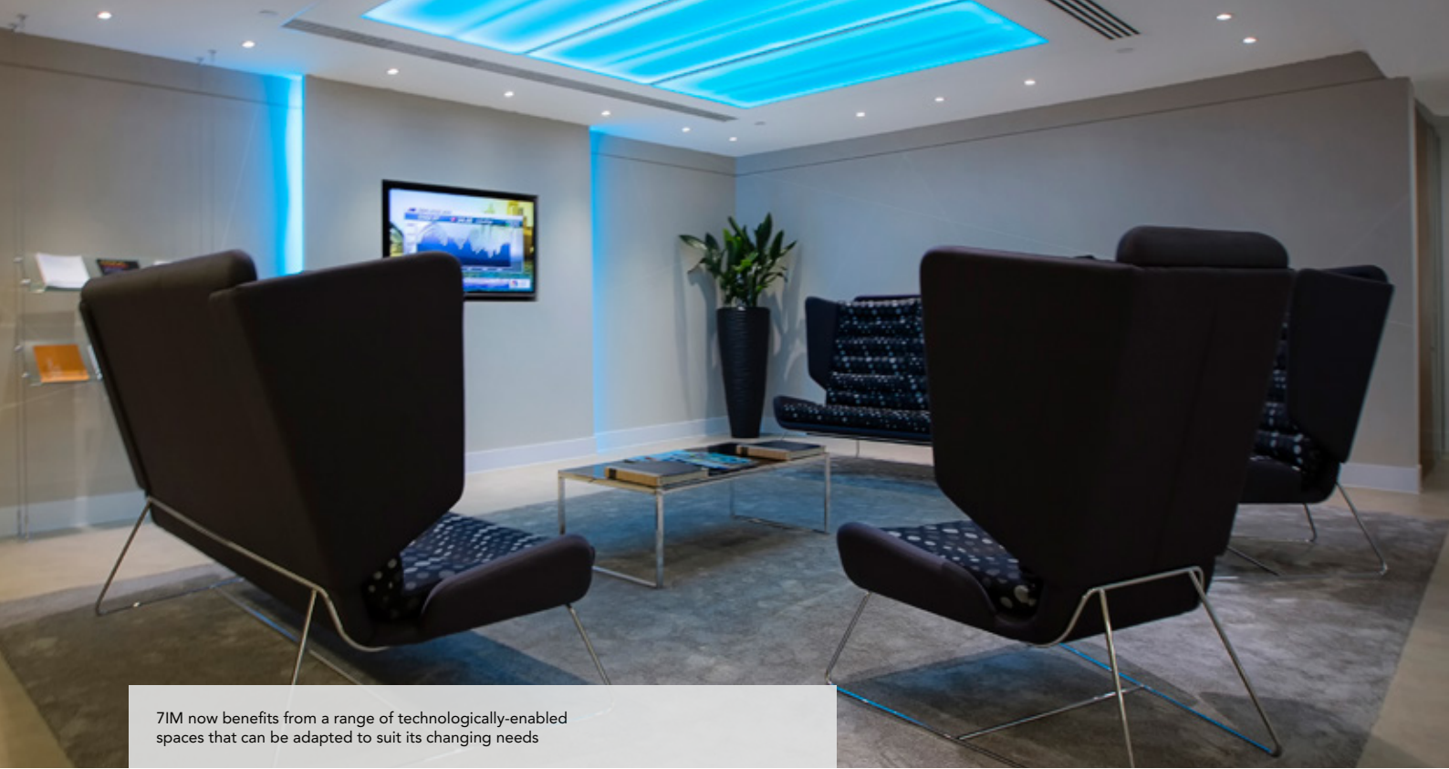
7IM now benefits from a range of technologically-enabled spaces that can be adapted to suit its changing needs