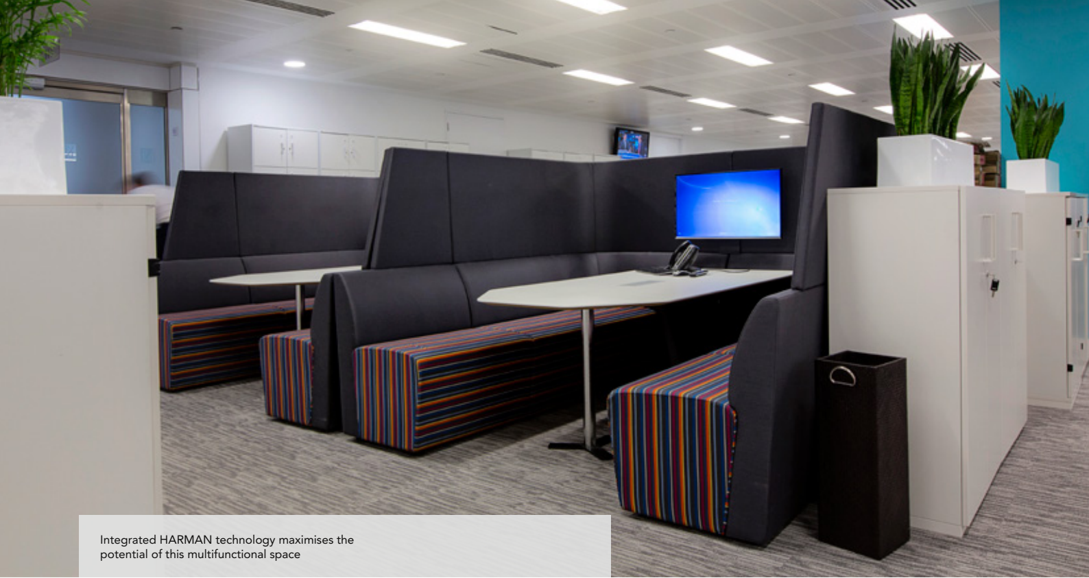
Integrated HARMAN technology maximises the potential of this multifunctional space

Founded in 2002 and with over £10 billion in assets under management and administration, Seven Investment Management combines investment management and banking products with an award-winning platform and a high level of service. When the company moved into prestigious new offices in Bishopsgate, it knew that it wanted to make a number of strategic investments of its own. Enter leading systems integrator AT&C and a HARMAN-centric technological solution, built around a core AMX architecture, which is designed to ensure that integrated systems not only support the 7IM business proposition, but add value to it, for maximum ROI.