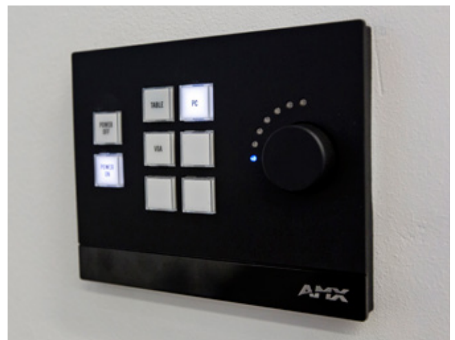
Processing power and keypad usability, in a single unit